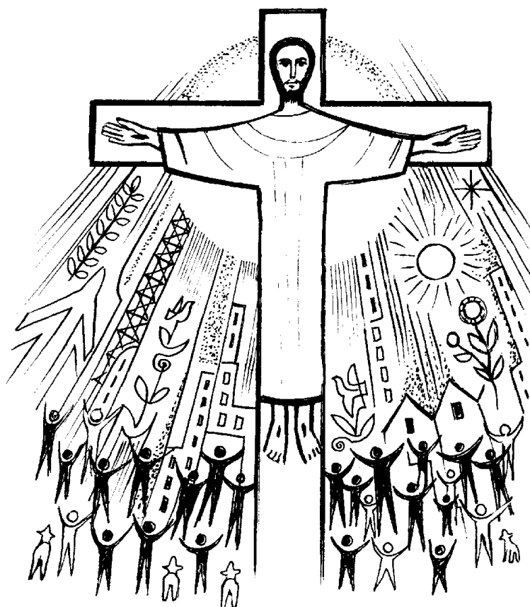
5 th Sunday Lent Year B

Stay safe, Remain Blessed, Happy Sunday to you.