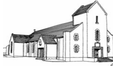
Holy Name, Oakley

Designed in 1958 in an early Scottish style and consecrated October 1965. Visit to see the small museum and outstanding stained glass windows by Gabriel Loire of Chartres.