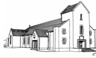
Holy Name, Oakley

Open from 12-4pm on 17 th September , Holy Name (designed in 1958 in an early Scottish style and consecrated in 1965) has a small museum and outstanding stained-glass windows designed by Gabriel Loire of Chartres.