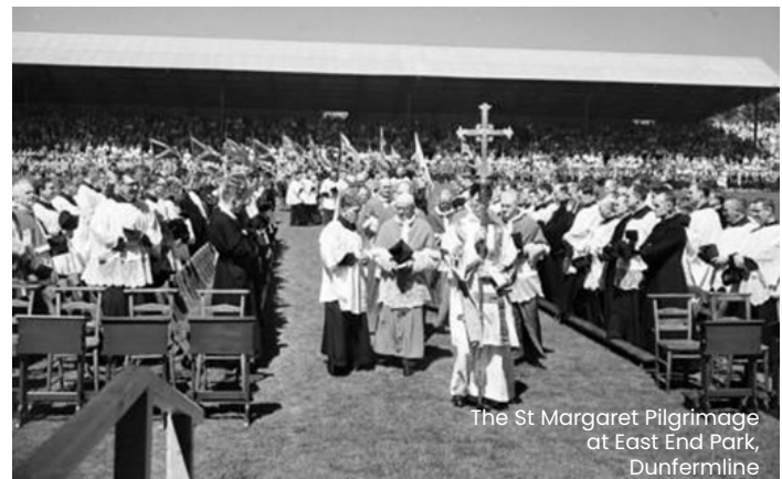
The St Margaret Pilgrimage at East End Park, Dunfermline