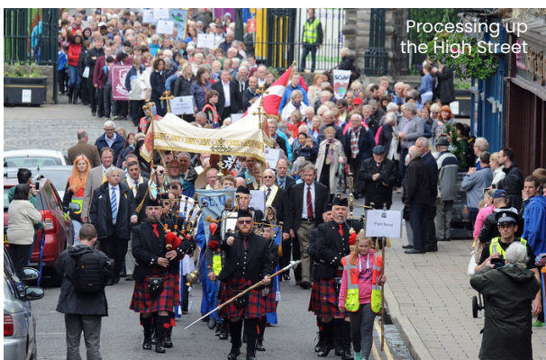
Processing up the High Street

St. Margaret's Cave will be open on the day for visitors from 12:15pm to 3:30pm. We recommend that pilgrims visit the cave and descend the atmospheric 87 steps to where St Margaret prayed over 900 years ago. Dunfermline Abbey will also be open directly after the 12:30pm prayer service.