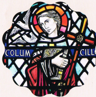
SAINT COLUMBA OF IONA

Right now we need you to help us continue our great work!