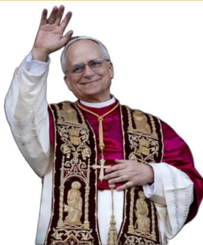
Pope Leo XIV

The college of Cardinals elected the Chicago-born Augustinian missionary Robert Prevost to succeed Pope Francis on Thursday and follow in his footsteps on social justice. In naming himself Leo, the new pope wanted to signal a strong line of continuity: Brother Leo was the 13th century friar who was a great companion to St Francis of Assisi, whom the late pope was named after.