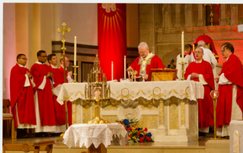
HOLY MASS AT ST MARGARET'S