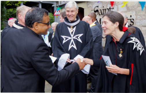
ST MARGARET'S CAVE