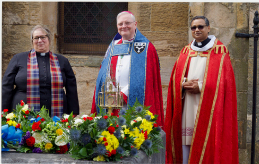
ST MARGARET'S TOMB