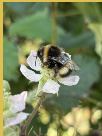
RESTING BEE BY SARA DOWNIE