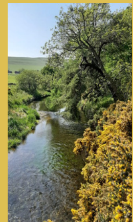
KINROSS BY ANONYMOUS