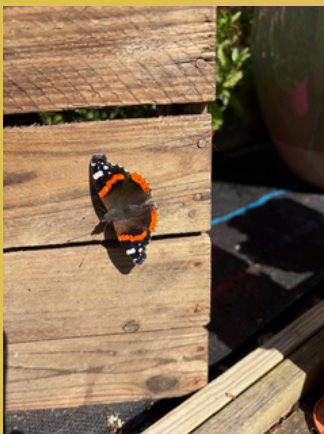
RED ADMIRAL BY JIM BRENNAN

Here are some of your nature photos so far that reveal the beauty and wonder of creation. Inspired? Please send your photo by 30 th September!